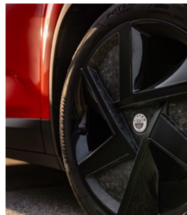
Exemplary image, SlipStream Black