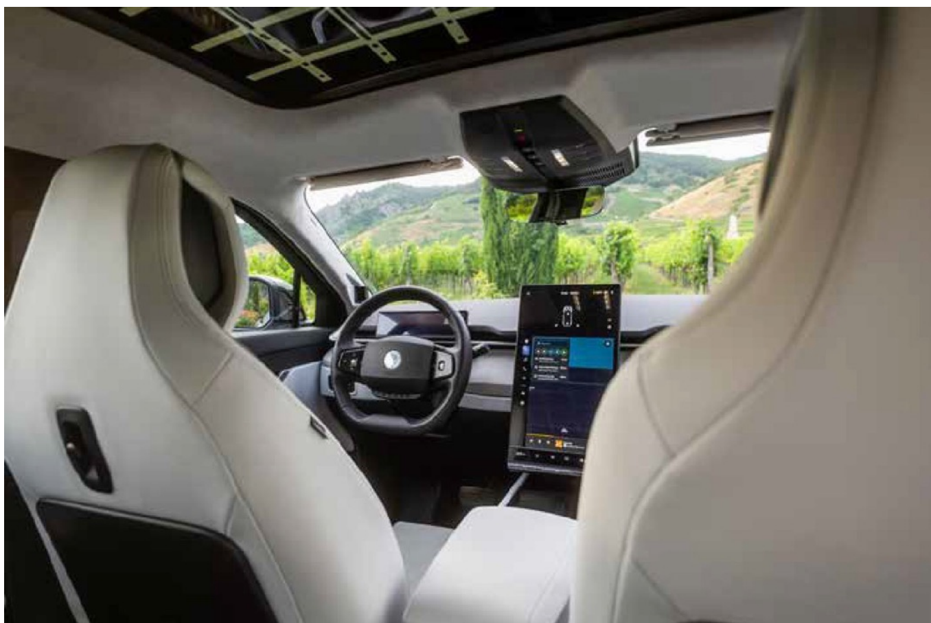
Image, Sea Salt, White Alcantara